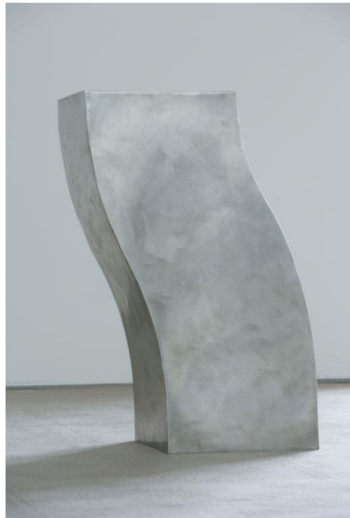
Turnbull, Duct, 1966, stainless steel, 118 x 50 x 50 cm