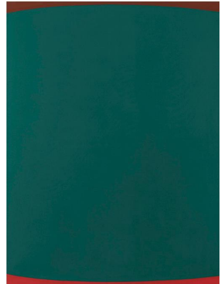
William Turnbull, Negative Green , 1961, oil on canvas, 152 x 203 cm

William Turnbull: Expanding Colour 1958-1972