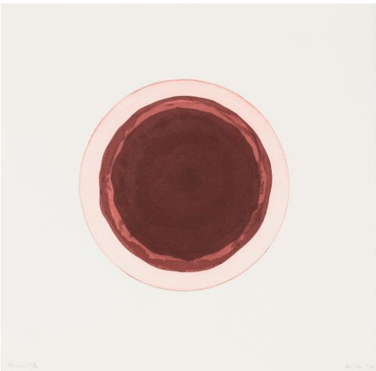
Kim Lim, Rose Madder (Red Disc) , 1970, aquatint, 41 x 41 cm, edition of 20