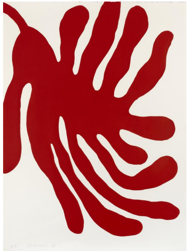
William Turnbull, Red Leaf , 1967, lithograph, 79 x 59 cm, edition of 75