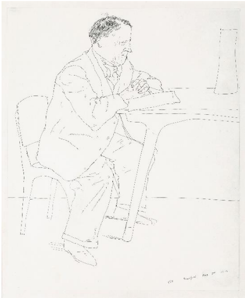
David Hockney b.1937, The Artist's Father , 1972

This exhibition brings together modern portraits from the gallery's inventory, with newer works by represented artists and guest artists who are showing with us for the first time. The portraits date from 1907 to the present and encompass photography, printmaking, drawing, collage, painting and ceramics. While each work has been selected for its individual qualities, when brought together certain emotional themes and conceptual strategies emerge, connecting images made in different times and places.